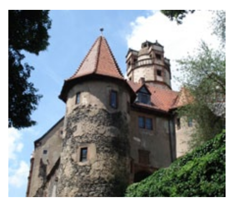
Ronneburg (venue of the evening reception)

Since the first event in 2007, the number of participants of the yearly CAR 2 CAR Forum has been steadily increasing, from about 80 to more than 140 this year. This year, the number was limited by the capacity of the lecture room at the Honda Academy, Erlensee). According to the proven format, the CAR 2 CAR Forum was organised on two days. The first day provided plenary sessions on standardisation and harmonisation, interoperability, security and FOTs, as well as a panel discussion on cooperative ITS and its joint deployment in Europe. After the plenary sessions, the programme was divided into a general assembly for all active members and a visitation of the Honda Academy for the basic members and invited quests who could experienced the impressing technology covering all fields of mobility and beyond. The evening event at castle Ronneburg started with campfires and hot wine punch in the inner ward. Afterwards, the participants enjoyed a juggler performance, as well as dinner and networking in the old, but snuggish restaurant room of the castle. The second day was structured into 5 workshops, focusing in more detail on deployment, security solutions, wireless and application aspects of cooperative ITS, as well as on the demonstration during the ITS World Congress 2012 at Vienna. The pdf documents of all presentations shown are available and can be downloaded from the internal website www.car-2-car.org.